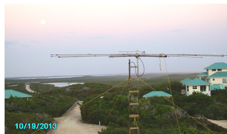
Westward pointing 10 meter monobander

We decided to pull out the Icom 736 since it had computer control. It was dead also. (Was working when pulled out of service) After some troubleshooting it joined the 950 and 1200 in the Murphy pile. The TS-930 was pulled from the box. At least it turned on, transmitted and received. (No computer control). The tuning dial would allow you to turn up in freq, but not down. I was able to tear it apart and fix that, it also had another small problem (don't remember what) that was also fixed at the same time. Ron and Mike put the 10 meter monobander up about 10 feet in front of the house pointed west.