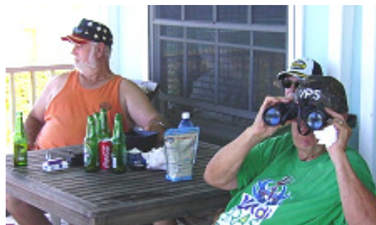
Here's a rare picture: Three of the four VP5DX crew shown 'taking a break'; L-R: AB4UF; N4EPD partially hidden behind N4KE with binoculars. Not shown, photographer NU4Y.