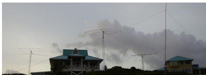
Final VP5DX antenna setup, L-R; A4 @ 30ft; SteppIR @ 60ft; 4 el 10m mono at 10 ft; 160m inverted L

Our final setup ended up as: The runner station was the TS-930 with the band pass filters, beverage box, and the AL-80, laptop, with external monitor and USB keyboard. The Mult Station was the IC-756 with beverage box and AL-1200 and the last desktop computer. Only failure during the contest was the laptop locked up 1 time on Sat, and 2 times on Sunday, I don't think it was rf, but overhead in windows or some update taking place. The lockups were only about 1 min each time, but during high rate runs was a real pain. At the start of the contest, was on 15 meters, could not get any real run going. Moved to 20 meters on the A4 pointed north, and we were off to the races, US, deep EU, AS everything coming in. Could not believe the number of VU's worked. — Continued on page 6