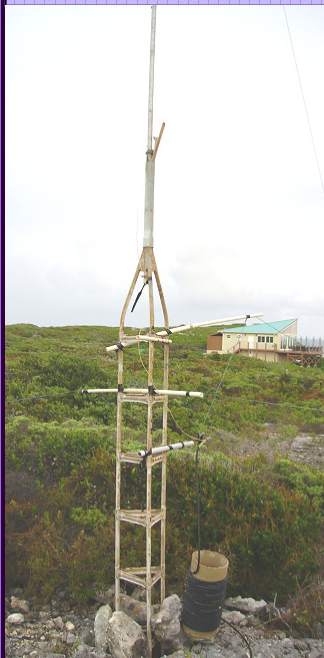
VP5DX 160 meter Inverted L antenna. Note large shipping tube choke coil. Ugly dude, but it worked like a champ!

This antenna showed an impedance dip (after setting length) of 35 ohms. Proves again that there is no ground anywhere nearby. This is like the antenna is in free space almost. Ron played with the 160 that night and it worked well.